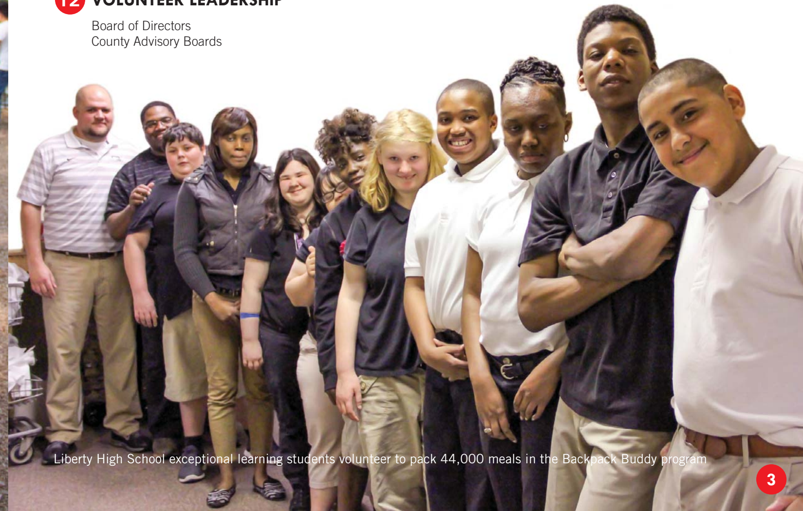
Liberty High School exceptional learning students volunteer to pack 44,000 meals in the Backpack Buddy program

Board of Directors County Advisory Boards